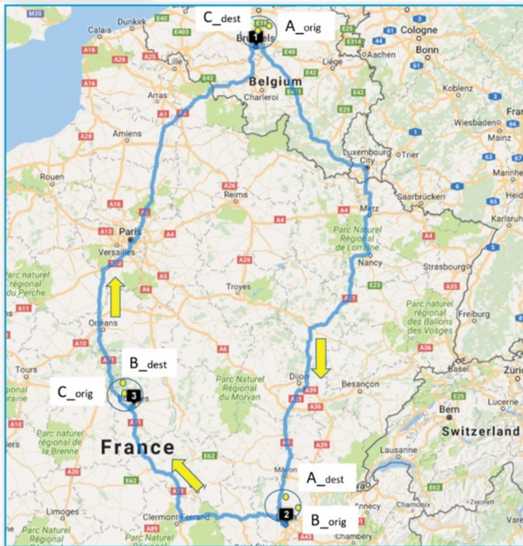
Figure 3: Example of a roundtrip opportunity that includes three shipments (A, B and C). The destination of A (Lyon) is close to the origin of B, whose destination is close to the origin of shipment C (Bourges). The destination of C (Brussels) is again close to the origin of A, which completes the roundtrip.

willing to cooperate, there are still many practical impediments. One of the most important hurdles is to find suitable partners with whom to collaborate. Creemers et al. (2017 [3]) developed an algorithm that can quickly analyze extremely large data sets for all the transport routes of one or more companies, looking for ways to combine geographically compatible shipments. Among other things, it uses the GPS coordinates of the beginning and end of each route. Typical examples of opportunities include: