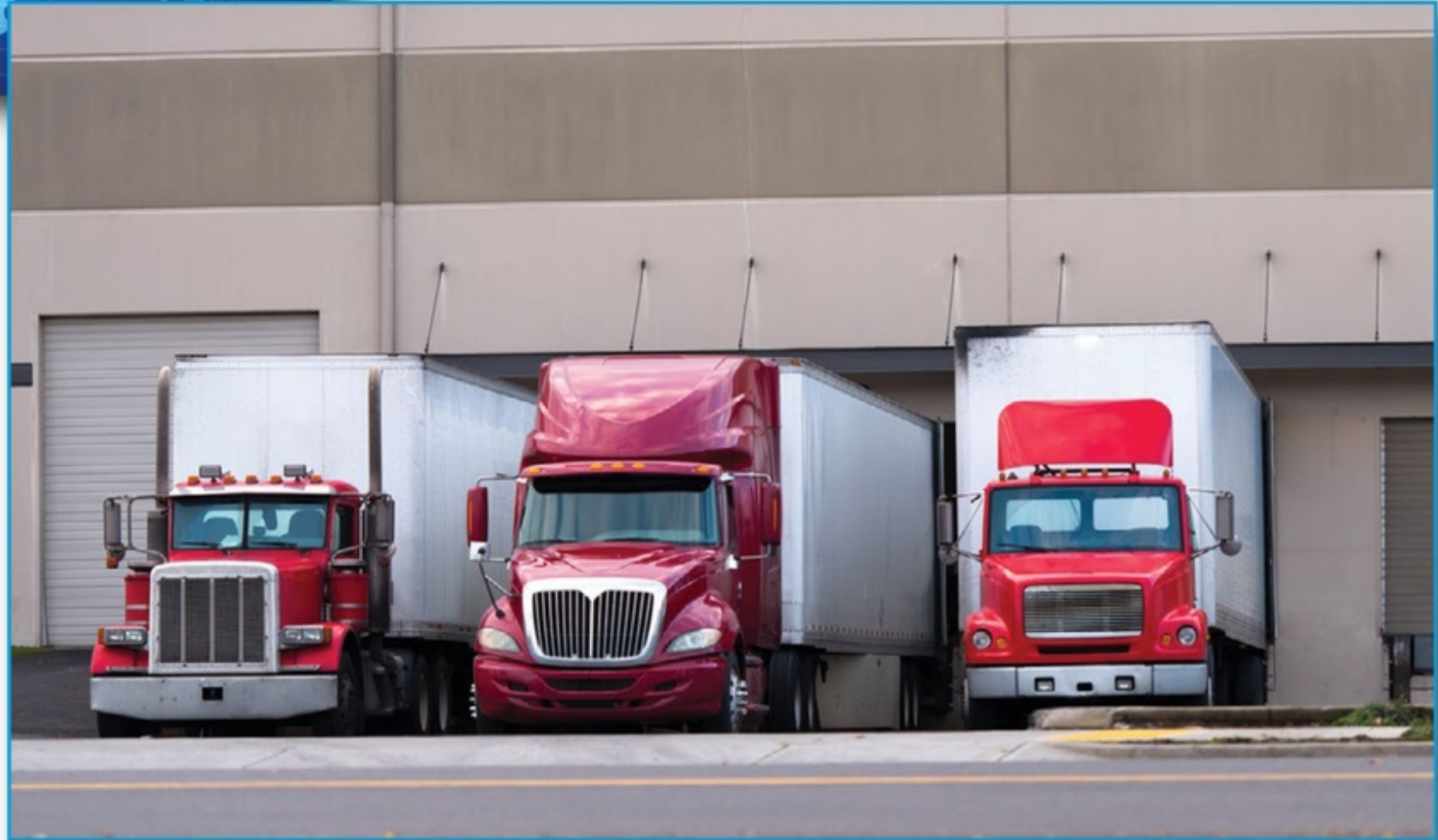
Horizontal collaboration: Where companies at the same level of the supply chain establish partnerships.