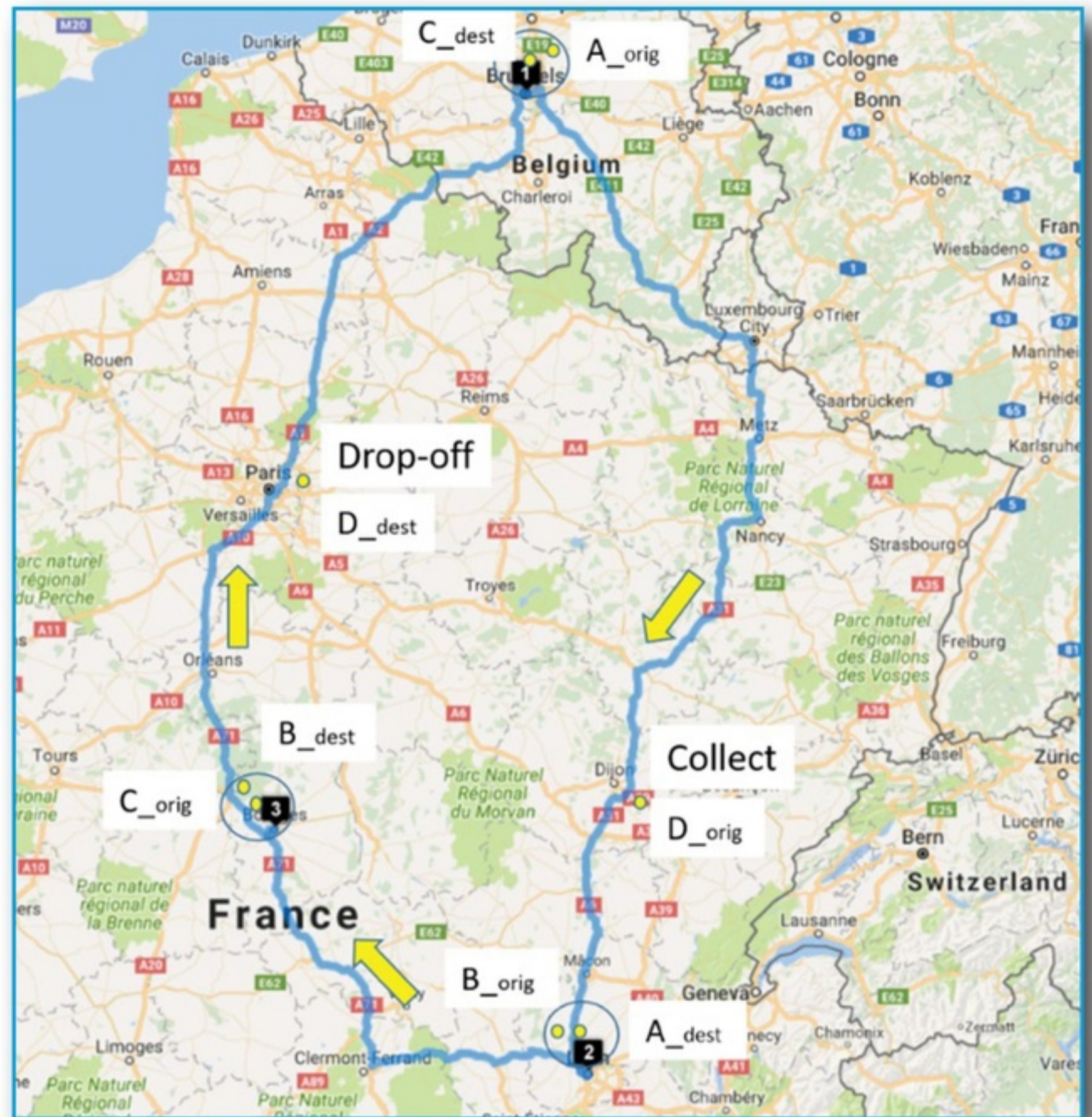
Figure 4: Example of a complex collaboration opportunity. The roundtrip including shipments A, B and C is completed with the collection of shipment D in Dijon as a bundling with shipment A. This shipment D is dropped off near Paris on the route from Bourges back to Brussels (after a bundling with shipment C).